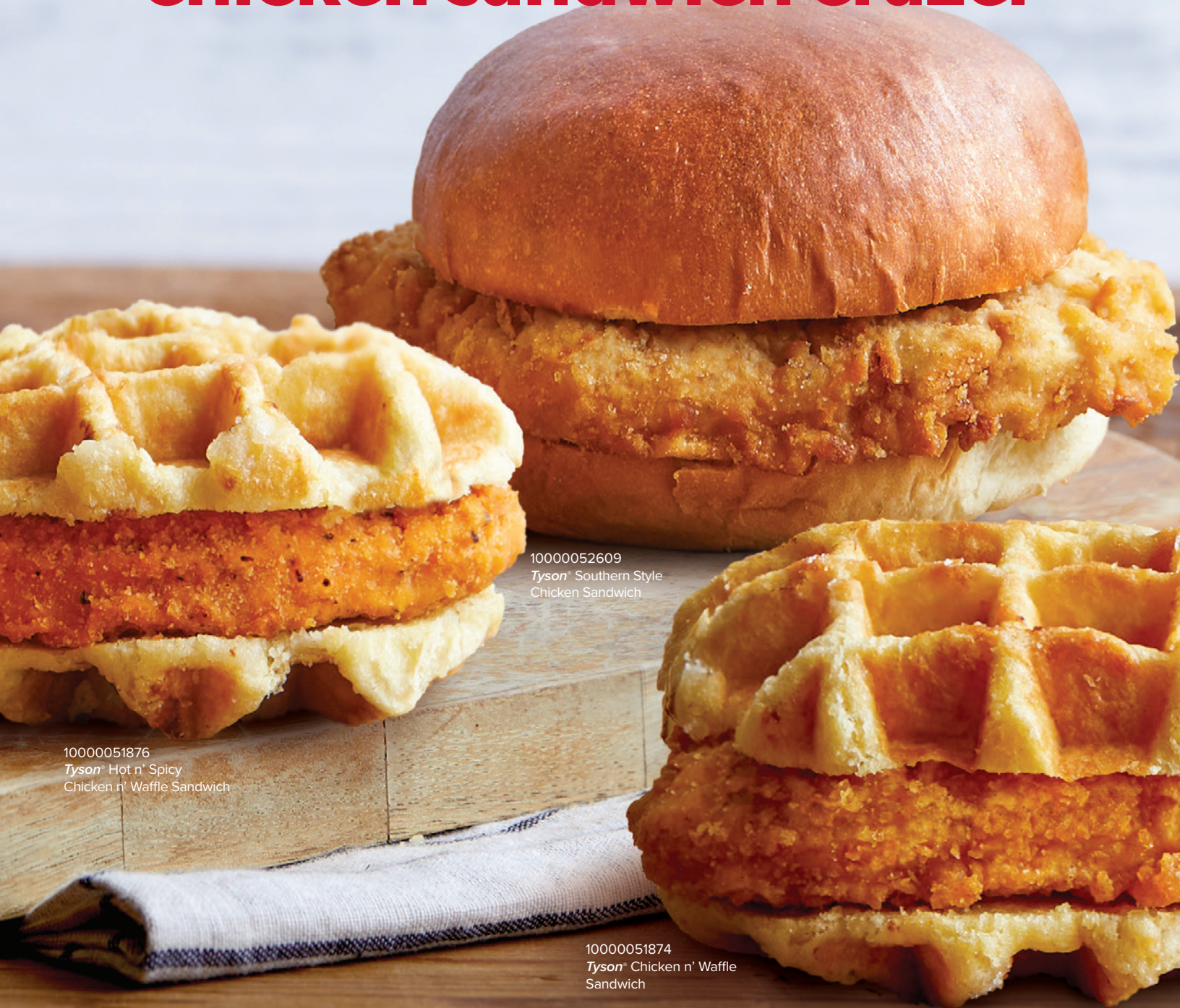
10000052609 Tyson® Southern Style Chicken Sandwich