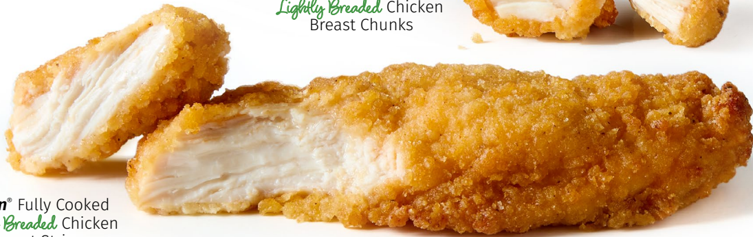
Tyson® Fully Cooked Lightly Breaded Chicken Breast Strips