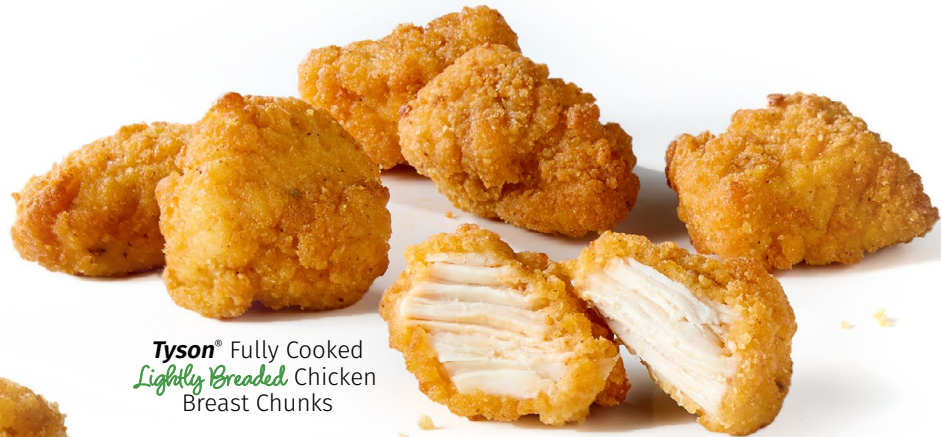
Tyson® Fully Cooked Lightly Breaded Chicken Breast Chunks