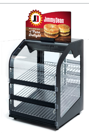
15.5"W x 32"H x 17.125"D