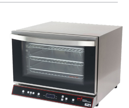
19"W x 14.25"H x 18"D